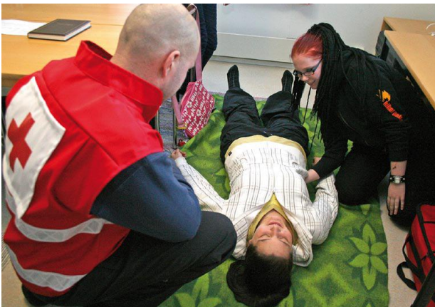
First aid group practicing.